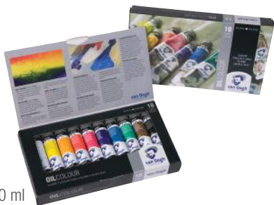
Cardboard set with 10 tubes 20 ml