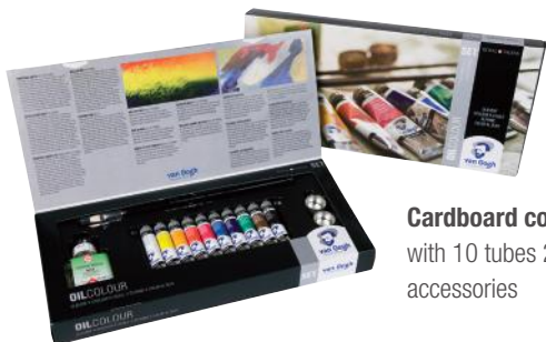
Cardboard combi set with 10 tubes 20 ml and accessories