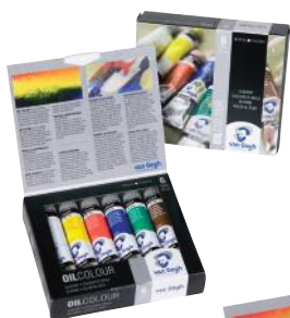
Cardboard set with 6 tubes 20 ml

In addition to a wide range of separate tubes, there are sets available with the most important basic colours, a combi set with accessories and various wooden artists' boxes. Looking for an original and creative present? Surprise someone with an oil colours set or an artists' box!